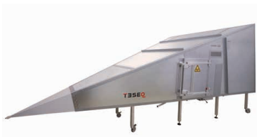
GTEM 1000, door right side

A GTEM (Gigahertz Transverse Electro Magnetic) cell is a test site for efficiently performing both radiated immunity and emissions testing in a single, controllable and shielded environment. Compared to other test sites, GTEM testing is faster with high accuracy and excellent reproducibility.