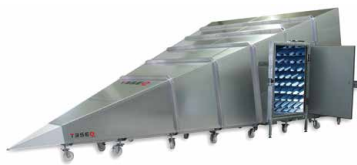
GTEM 1750, door right side, option EUT MG, option wheels

A GTEM (Gigahertz Transverse Electro Magnetic) cell is a test site for efficiently performing both radiated immunity and emissions testing in a single, controllable and shielded environment. Compared to other test sites, GTEM testing is faster with high accuracy and excellent reproducibility.