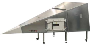
GTEM 750, door right side